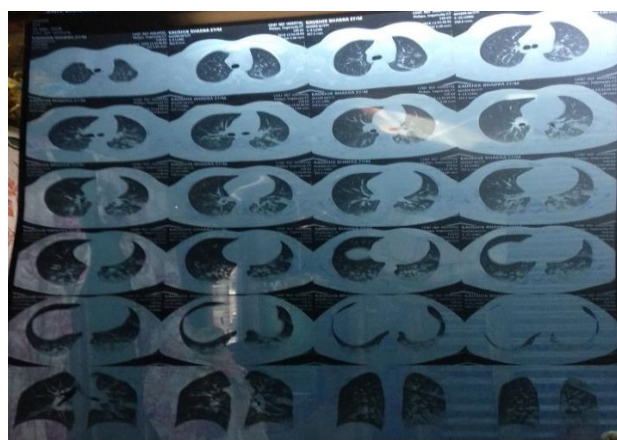
Figure 2: CECT CHEST B/L lower lobe ground glass opacifications

Predisposing factors for early development of HAPO and HACE are rapid rate of ascent, prior history of high altitude illness, severe exertion, young and tender age, male sex, respiratory tract infection, cold environment, abnormalities of cardiopulmonary circulation and smoking. 1,8 The risk factors present in studied patient were young age, male sex, rapid ascent without proper acclimatization and smoking. HACE is usually not encountered below 9840 ft and HAPO is also rare below this altitude. 9 In earlier studies, HAPO and HACE as comorbidity were seen at super high-altitude areas above 23000 ft. 7 However, in this particular case the altitude was only 12000 ft. Hence the interrelationship between simultaneous occurrence of HAPO and HACE to altitude cannot be established.