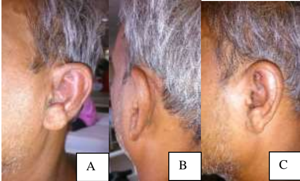
Figure 1(A, B, C): Multiple vesicular eruptions with crusts on the left pinna.

There was infranuclear type of palsy of left 7 th cranial nerve along with Bell's eye phenomenon (Figure 2). Tympanic membrane was intact with normal oral cavity and oropharynx. Extra ocular movements were intact and the pupils were normal in size and reacted to light bilaterally.