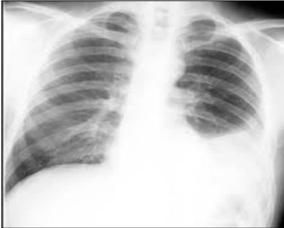
Figure 1: Chest radiograph P/A view left sided pleural effusion.

venom specific IgE could not be done due to lack of availability of the test at our center. HIV serology was negative. Sputum microscopy for AFB is negative. Chest x-ray was suggestive of left-sided pleural effusion (Figure 1). Thoracocentesis was done. The pleural fluid analysis was suggestive of exudative fluid. ECG was normal in sinus rhythm. Echocardiography was revealed preserved left ventricular systolic function (LVEF = 56%) without intracardiac vegetation or thrombosis.