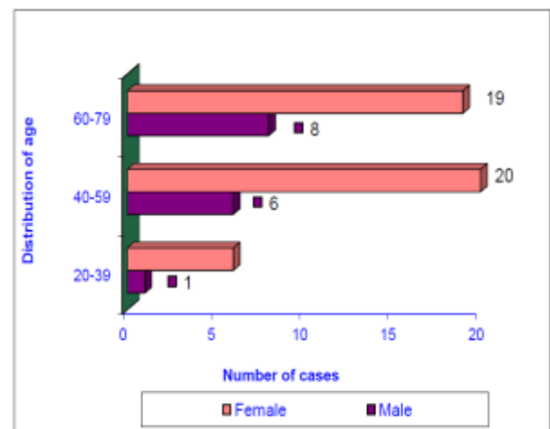
Figure 2: Distribution of age.

The distribution of risk factors was ear infection, ototoxic drugs, history of surgery, trauma (Table 2). Among these, significant risk factor was found in the patient with ear infection (31.6%). The predominance was found for female with the incident rate of (12/19). A similar increase in the prevalence in female (9/11) was found in the trauma patients. Based on the distribution of risk factors, age group 40-59 was highest followed by the age group of 60-79. The only 1 male patient in the age group of 20-39 had ear infection as the risk factor and was presented with both spinning and about to faint.