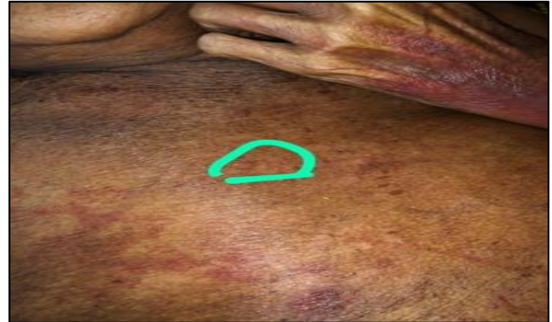
Figure 4: Spider nevi in patient.

mmol/l; potassium 4.9 mmol/l; chloride 96 mmol/l. Thorax X-ray examination results emphasized on aortosclerosis, minor fissure thickening dd. Pocketed right pleural effusion and high location of the right diaphragm. Abdomen ultrasound examination showed the results of hepatic cirrhosis, cholelithiasis with chronic cholecystitis and ascites.