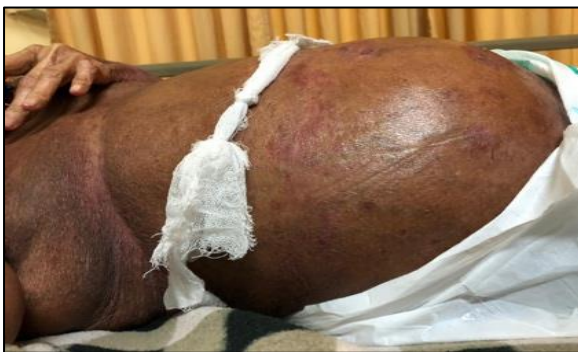
Figure 3: Ascites in patient.

In the laboratory's complete blood results of the patient, it was found: leukocytes 6.26 \times 10^3/\mu\text{l} ; erythrocytes 3.62 \times 10^6/\mu\text{l} ; hemoglobin 10.2 g / dl; hematocrit 31.9%; platelets 156 \times 10^3/\mu\text{l} . Blood chemistry examination showed: albumin 2.1 g/dl; SGOT 15 U/L; SGPT 45 U/L; urea 11 mg/dl; blood creatinine 0.6 mg / dl; sodium 134