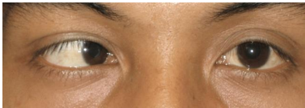
Figure 1: Right eye esotropia of the patient.

any other abnormality in extraocular movements (Figure 1).