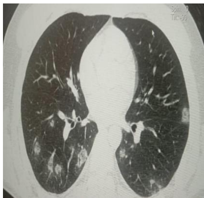
Figure 2: axial CT image with mild CTSI.