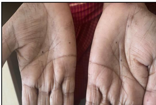
Figure 1: Multiple telangiectatic spots noted over the palm aspect of hands.

Laboratory investigations revealed severe anemia with HB 2.4 gm/dl. All the parameters related to RBC were decreased with RBC count- 1.7 million cells/cumm, PCV- 10.9%, MCV- 64.1 fl, MCH- 14.1 pg and MCHC- 22 g/dl. Platelet count was 5.28 lakhs/cumm. Peripheral smear study showed severe microcytic hypochromic anemia and thrombocytosis.