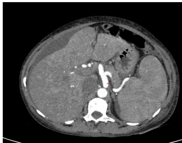
Figure 4: Coeliac artery is dilated.

It was noted that Mentzer index was 37, serum ferritin 23.2 ng/ml (normal serum ferritin: 10-120 ng/dl), serum iron- 27 (normal serum iron: 65-176 µg/dl), and transferrin saturation was 9.89% (normal transferrin saturation: 15-50%). Coagulation profile (bleeding time- 4 min, clotting time- 104 sec), PT/ INR/ aPTT/renal function test, liver function tests and urine analysis were all within normal limits.