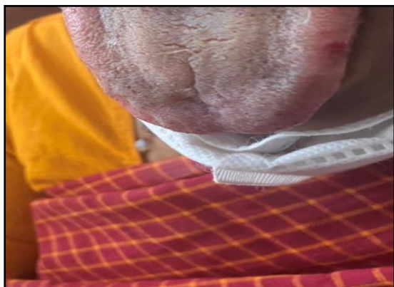
Figure 2: Telangiectatic spot noted in the tongue.