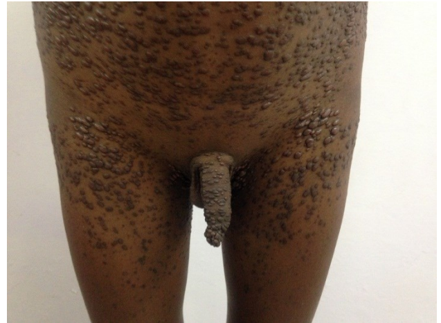
Figure 3: Lesions on the lower abdomen, genitals & groins.