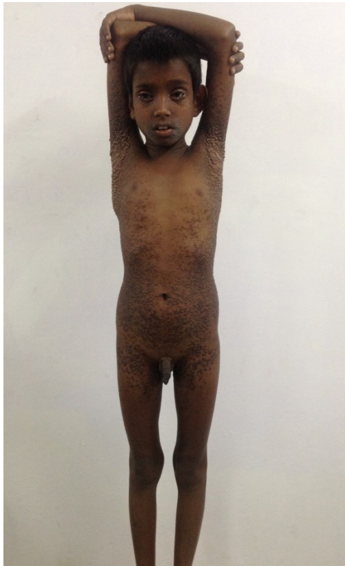
Figure 1: Eruptions all over the body.

Palms & soles unremarkable. Scalp hair were not involved. Investigations revealed Hb 10.0 gm/dl. TLC 9000 per cubic mm. N55, L30, E15, M00. Platelet count 3.0 lakh/cumm. Urine RE: shows 2-4 pus cells. LFT: WNL. Lipid profile: S. cholesterol 144.0 mg/dl. Serum triglycerides 119.0 mg/dl. Serum HDL cholesterol 47.0 mg/dl. Serum VLDL cholesterol 23.8 mg/dl. Serum LDL Cholesterol 73.2 mg/dl. Skin biopsy (on H&E staining at 40x) showed infiltration in dermis with lymphocytes, polymorphs, foamy histiocytes & eosinophils (Figure 4).