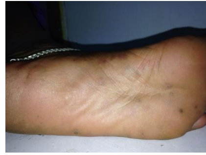
Figure 4: Lesion with central keratotic plugging interspersed with resolving hyperpigmented lesions.