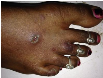
Figure 1: Central keratotic plugging is seen.

lymphocytes. Blood urea - 48 mg/dl, serum creatinine - 1.2 mg/dl. Blood sugar (random) - 91 mg/dl and chest X-ray was normal. USG abdomen revealed showed a left renal calculus measuring around 6.7 mm at lower calyx. Skin biopsy taken from the dorsum of the foot showed a shallow cup-shaped lesion with a central crusted ulceration containing degenerated collagen in vertical strands, parakeratotic horny material, inflammatory cells and transepidermal elimination of collagen fibres from the dermis through the defect in the epidermis (H & E - 100x) (Figure 5). In view of the clinical findings and investigations reports, a diagnosis of Acquired Reactive Perforating Collagenosis (ARPC) with renal calculus was made. Treatment with topical retinoids and antihistamines was started. When reviewed after 1 month of therapy, there was symptomatic improvement in skin lesions. Hair, Mucous Membranes and nails were normal.