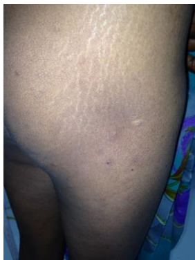
Figure 3: Lesions over buttocks.