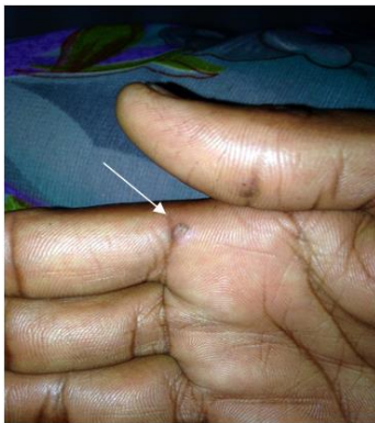
Figure 2: Lesion over palm.