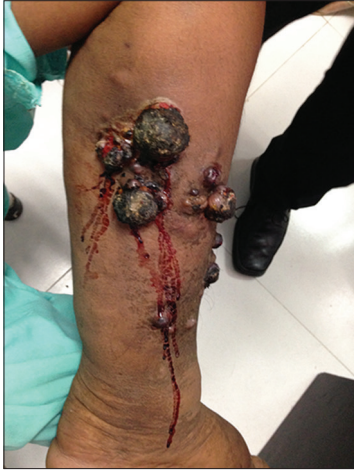
Figure 1: Ulcerative nodules on left leg.