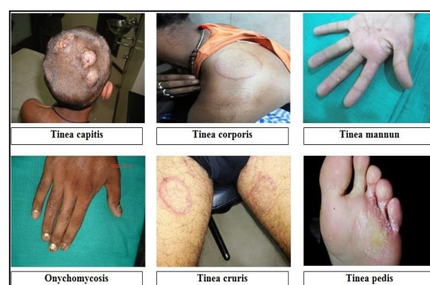
Figure 1: Different sites of superficial fungal infections in patients with ESRD.

The macroscopic examination of the scalp, skin and the nails of these 36 patients further revealed 2.2% Tinea capitis, 13.9% Tinea versicolor, 44.5% Tinea corporis, 8.4% Tinea mannum, 16.8% onychomycosis, 5.7% Tinea cruris and 8.5% Tinea pedis. Culture examinations revealed 44.4% Trichyopyton rubrum , 27.8% Trychophyton mentagrophyte , 2.8% Trychophyton violaceum , 2.8% Trichophyton verrucosum , 2.8% Microsporum canis , 2.8% Epidermophyton flucossum , 2.8% Scopulariopsis brevicaulis and 13.8% Mallessesia .