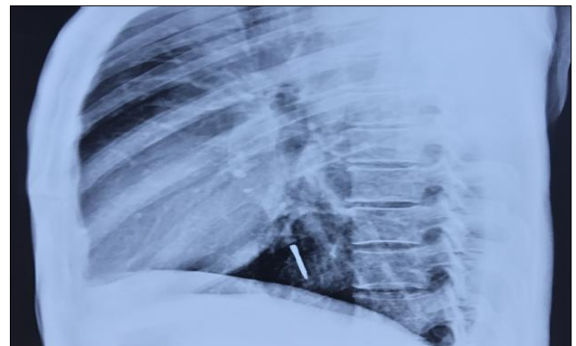
Figure 2: X-ray chest lateral view showing nail in right lung.

On Examination, there were no abnormal findings. X-ray Chest PA view showed radio-opaque foreign body in right lung-lower zone. It was medially placed with pointed end distally (Figure 1). X-ray Chest Lateral view showed radio-opaque foreign body in right lung in relation to right dome of diaphragm. (Figure 2) It is seen in medial segment of right lower lobe.