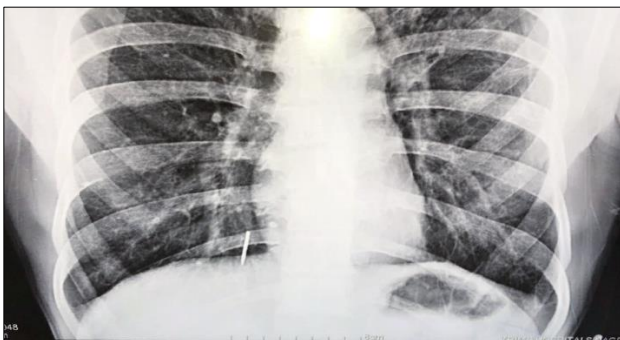
Figure 1: X-ray chest PA view showing nail in right lung.

45 years old male was referred to department of Pulmonology, KRIMS Hospitals, Nagpur, Maharashtra, India. He gave history of aspiration of nail 2 Days back. Since then he had cough. He was anxious regarding complications. There was no dyspnea or hemoptysis. There was no significant past history or co-morbidities.