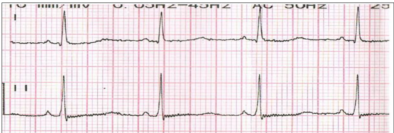
Figure 1: ECG tracings of patient.